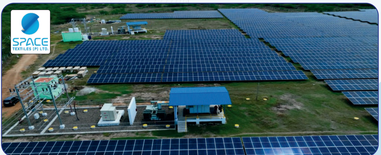
SPACE TEXTILES, TIRUPUR. CAPACITY - 7.2 MW