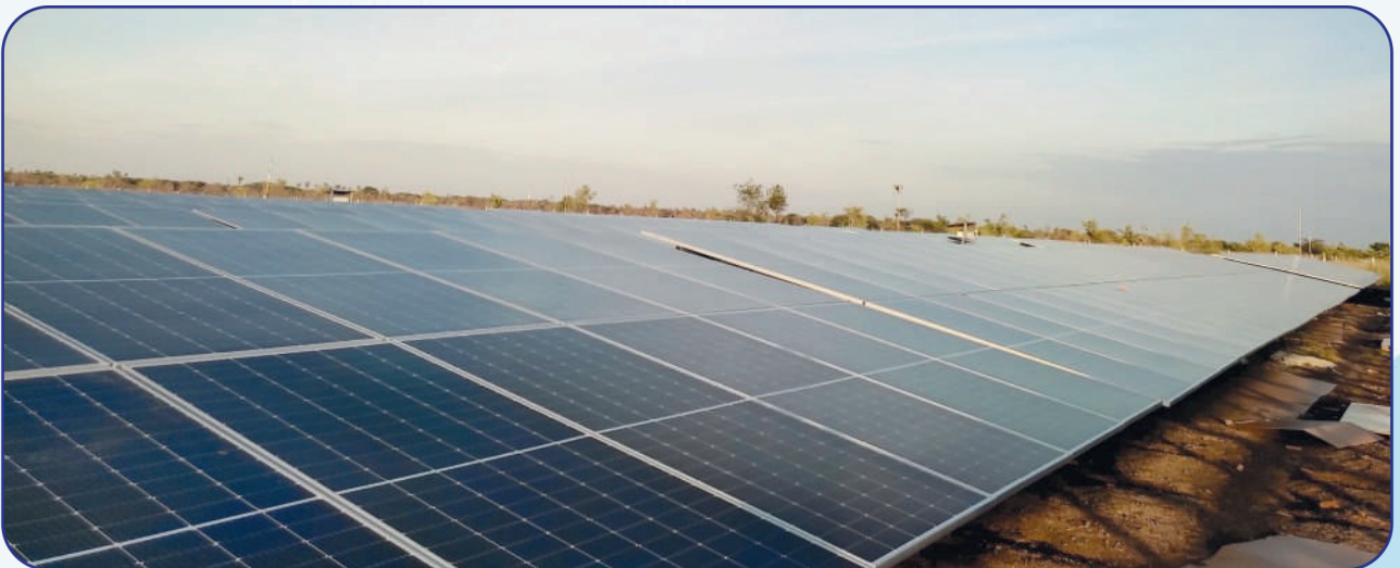
PEM POWER ENERGY P LTD, TIRICHY. CAPACITY - 2.6 MW