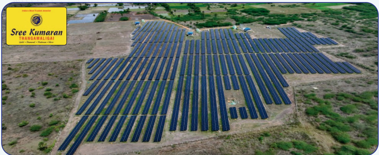
KTM JEWELLERY, COIMBATORE. CAPACITY - 2.4 MW

Mounting structure : The structures has been designed for 140 km/Hr wind speed and will be made up of hot dip galvanized mild steel of suitable size and designed to withstand forces during normal conditions and abnormal conditions.