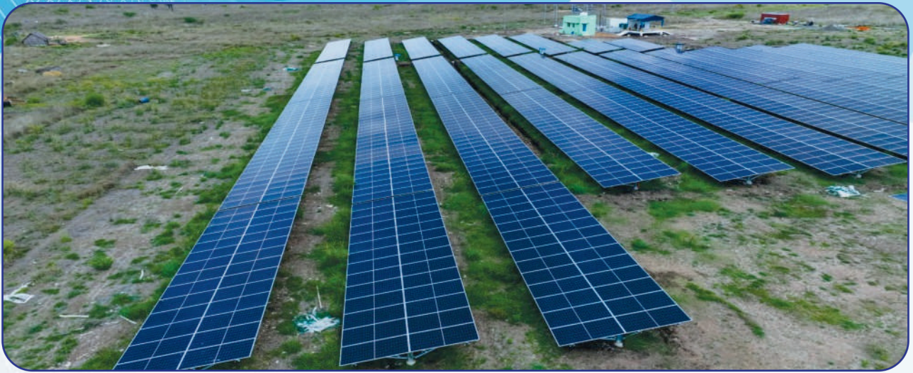
SHRI SATHAASIVA, NAMAKKAL. CAPACITY - 5.2 MW