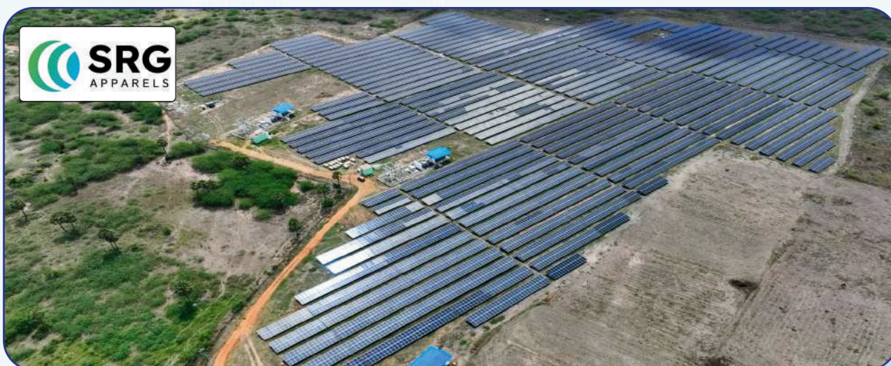
SRG APPARELS LIMITED, TIRUPUR. CAPACITY - 5.2 MW