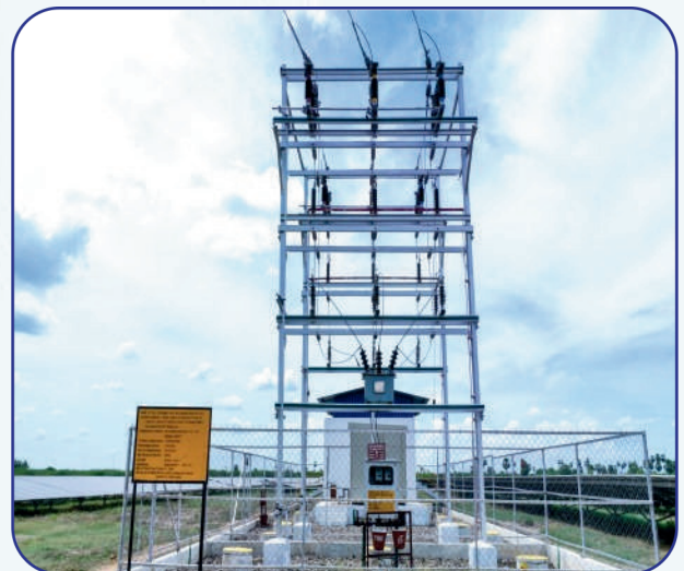
4 POLE STRUCTURE