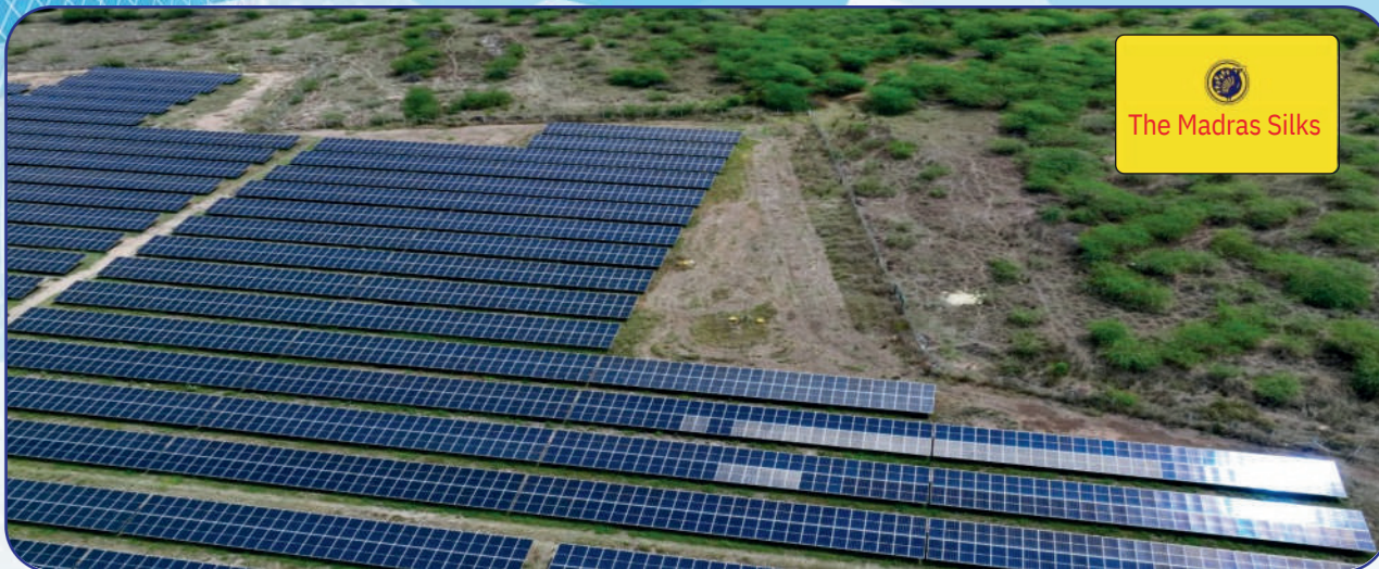
THE MADRAS SILKS, CHENNAI. CAPACITY - 2.4 MW