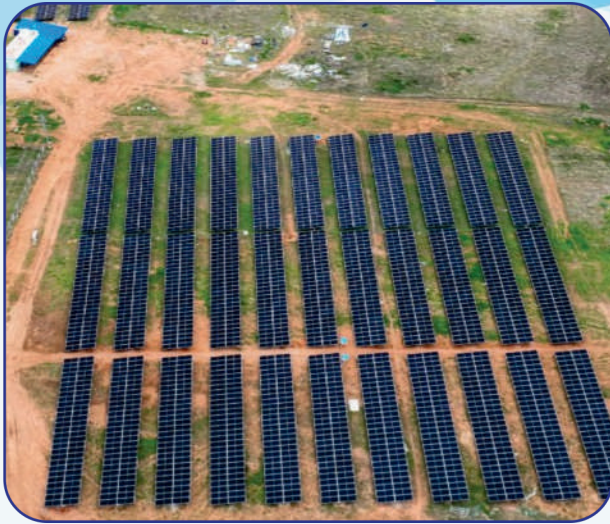
MARUTHI TEXTILES, TIRUPPUR. CAPACITY - 1.2 MW