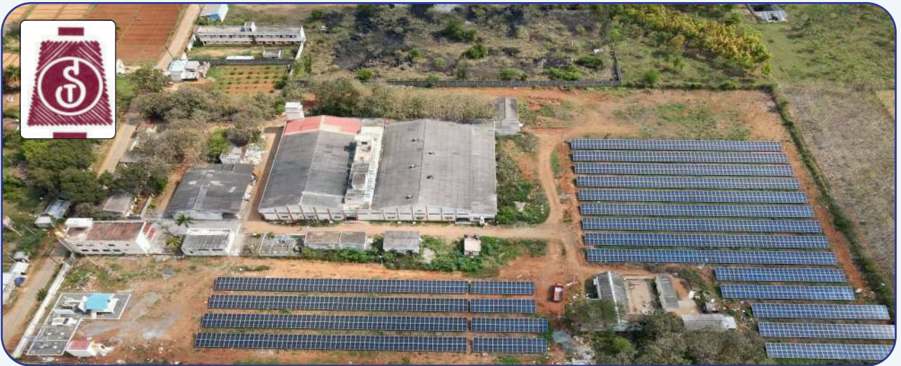
SUBADRA SPINNING MILLS, TIRUVANNAMALAI. CAPACITY - 1 MW