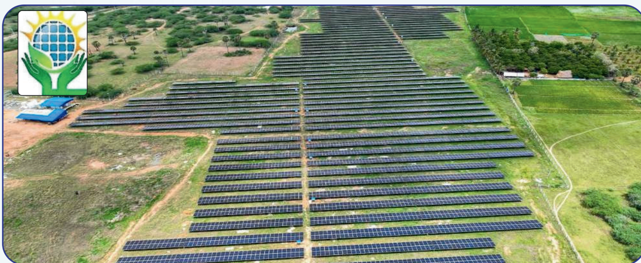
SULUR MAHARAJA, COIMBATORE. CAPACITY - 7.8 MW