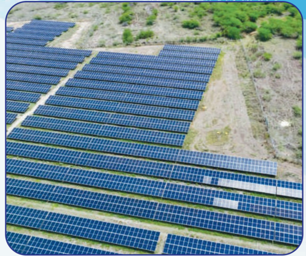
TOUNGARA KATI - MALI, AFRICA. CAPACITY - 5 MW